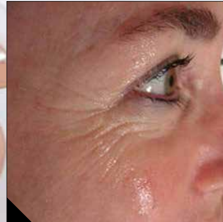
After 6 treatments