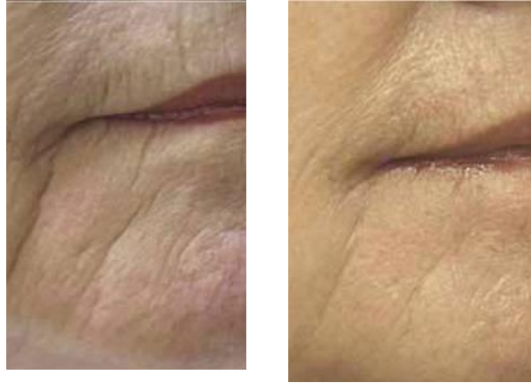
Skin resurfacing one month after 1 thermal mode treatment