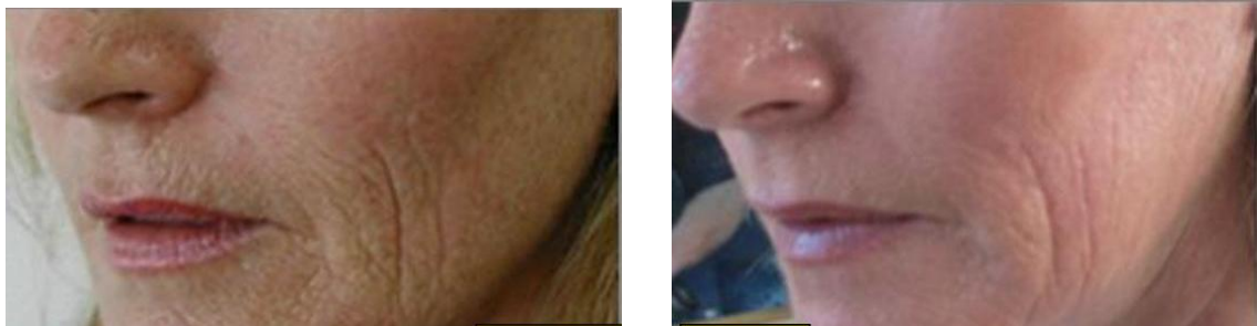
Skin resurfacing one month after 2 fractional mode treatments